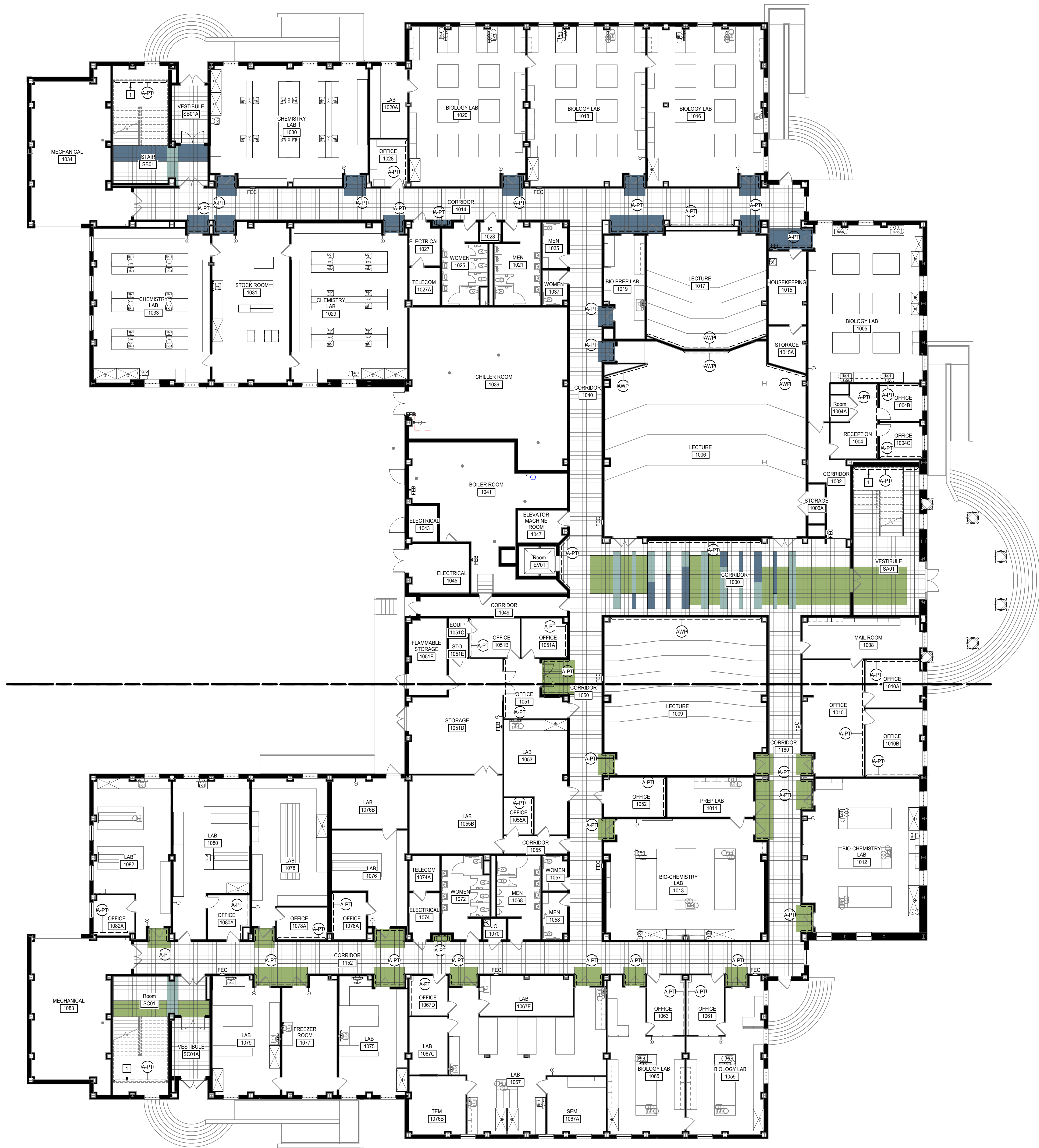
1 FIRST FLOOR ACCENT FINISH PLAN 3/32" = 1'-0"